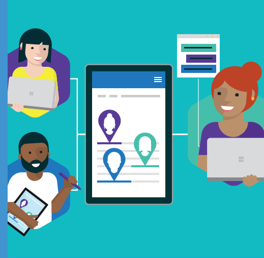
Connect your business

From day one, Microsoft Dynamics 365 for Finance and Operations, Business edition makes ordering, selling, invoicing and reporting easier and faster