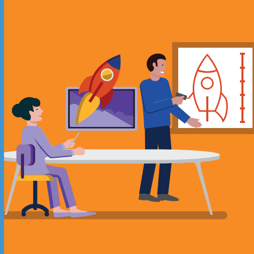
Make better decisions