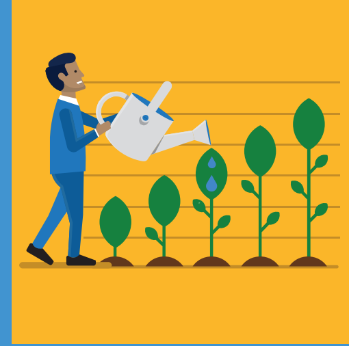
Start and grow easily

Connect your people and processes like never before